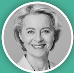
Ursula von der Leyen President of the European Commission