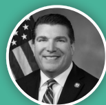
Jay Obernolte Vice Chair of the AI Caucus, US House of Representatives